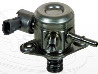
Gasoline Direct Injection (GDI)

Carter offers a wide range of fuel pumps, assemblies and other essential components for the professional installer. With a commitment to Engineered Quality™, Carter's patented design features ensure superior durability and performance. You can trust Carter to deliver solutions that are better engineered with better quality components to meet or exceed OE fit and function.